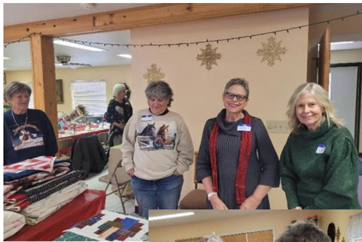
Show and Tell photos: