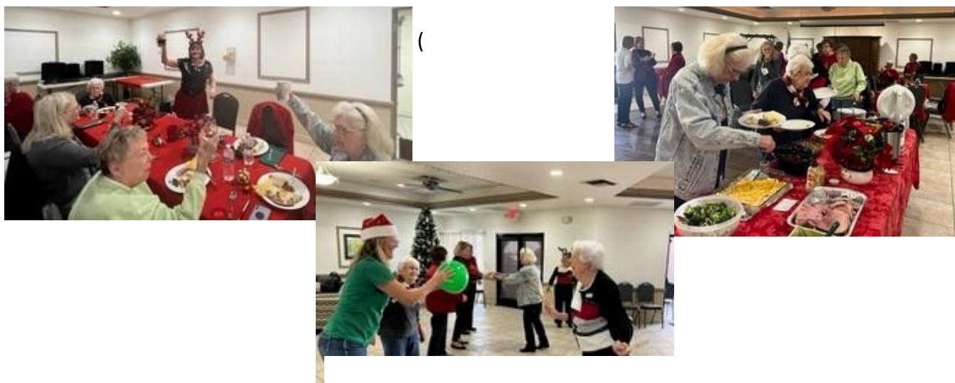
Sunrise Stitches Show & Tell December 2021

Needless to say the party was a success.